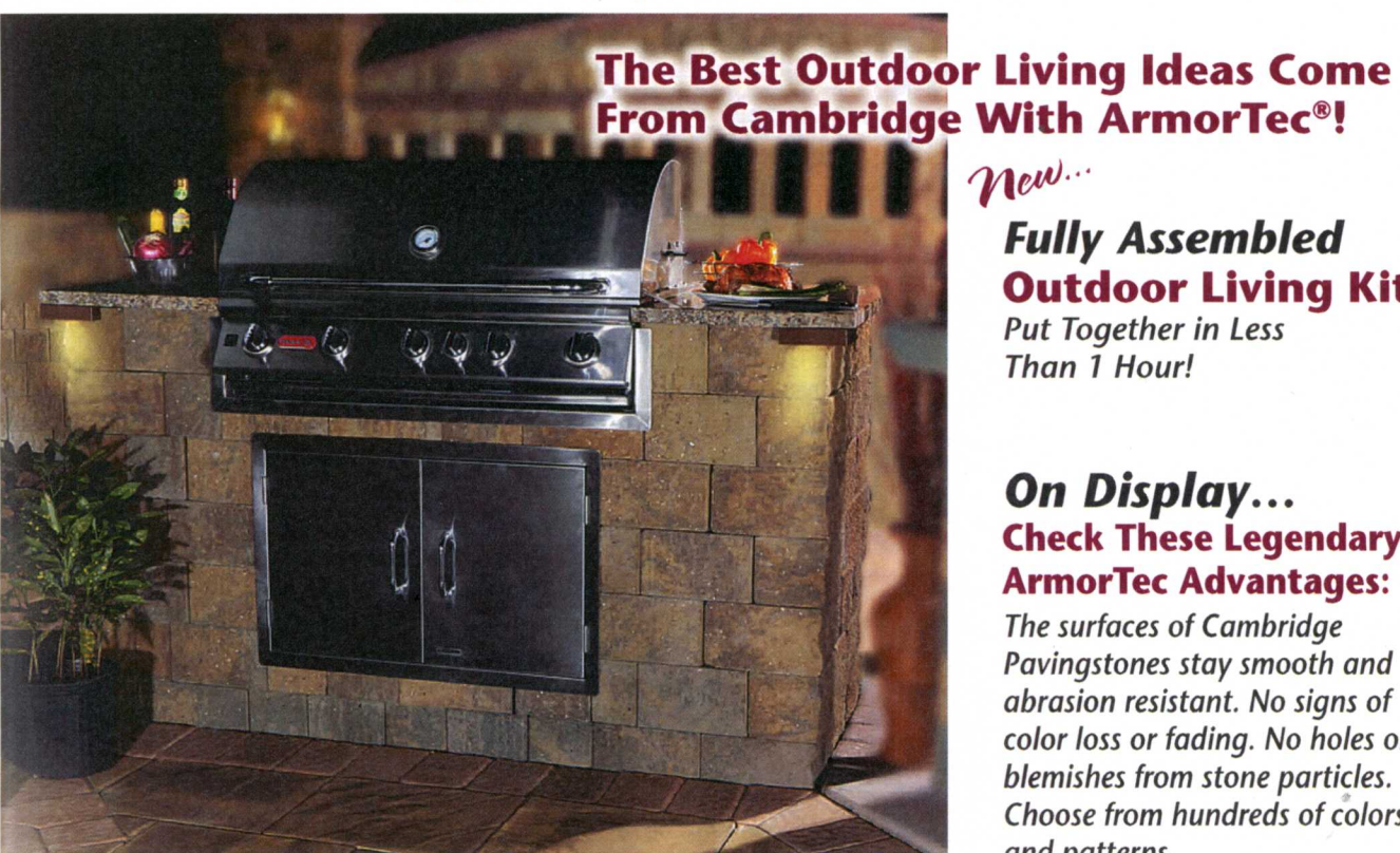
FREE!... 108-Page Cambridge Outdoor Living Idea & Color Guide!

Thursday, June 19, 2014 11:00 AM - 1:00 PM