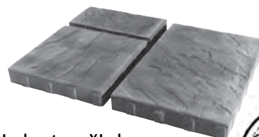
Ledgestone XL shown

Be aware of which shapes and colors your Cambridge Distributors stock. Tell the distributor which shapes and colors that you usually recommend to homeowners. You have a great deal of influence over your potential customer. Typically, the homeowner will ask you for your recommendation. Recommend shapes and colors that your distributor stocks and you will always be in a position to start any job immediately.